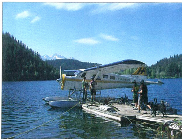
The best biking routes in Canada can only be reached by seaplane

To make the most of your stay, you'll need a guide as most of the "exquisite trails" are hidden. The guides at Big Mountain Freeride Adventures have "a simple mission: to bag some of the world's best – and least ridden – single-track trails while getting up close to the spectacular alpine landscape of the Southern Chilcotin mountains". They succeed: the trips are